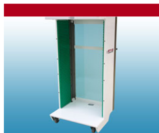
▶ Transport cart THS 63