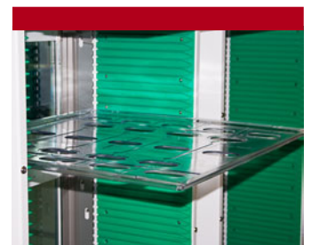
▶ Single rack for THS 63